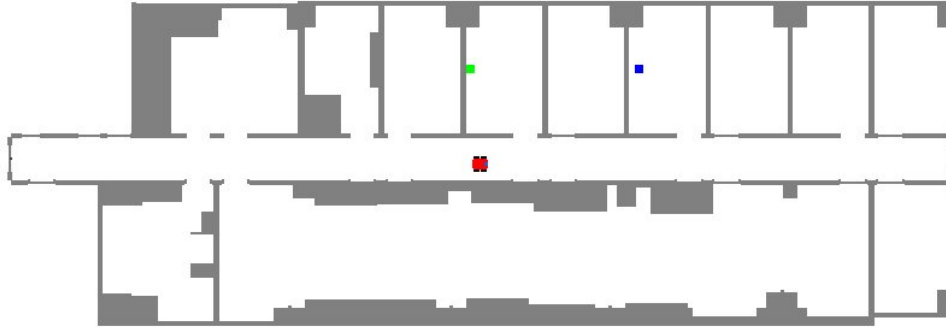
Figure 1: A map of a sample scenario; boxes are stand-ins for humans, where green indicates injured and blue indicates normal.

ification of information and creation of objects required to take advantage of opportunities that are encountered during plan execution. Using OWQGs, we can bias the heuristic’s view of the search space towards finding plans that achieve additional reward in an open world.