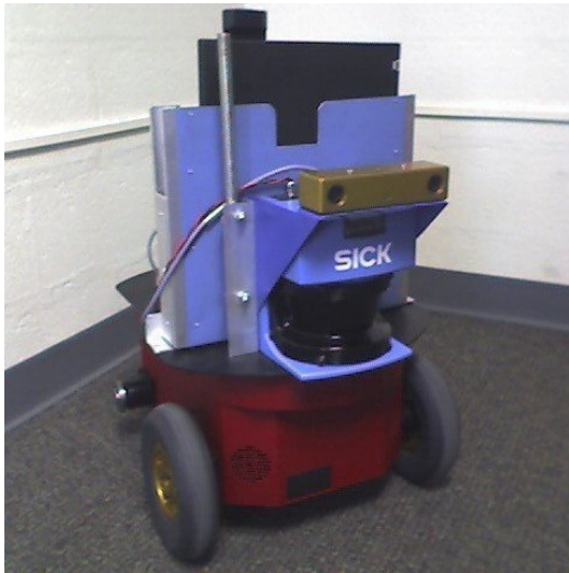
Figure 3: A Pioneer P3-AT on which the planner integration was verified.

ronments using local closed world (LCW) information produced by sensing actions (Etzioni, Golden, and Weld 1997).